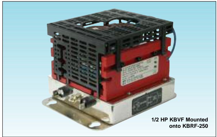
1/2 HP KBVF Mounted onto KBRF-250